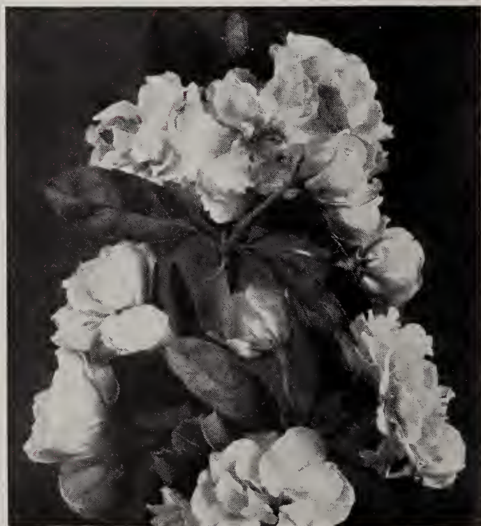
Bachtel's Double-flowering Crabs

Shidare-higan (Japanese Weeping Cherry). This weeping form makes a most beautiful specimen lawn tree. Flowers are single, deep pink, and come very early.